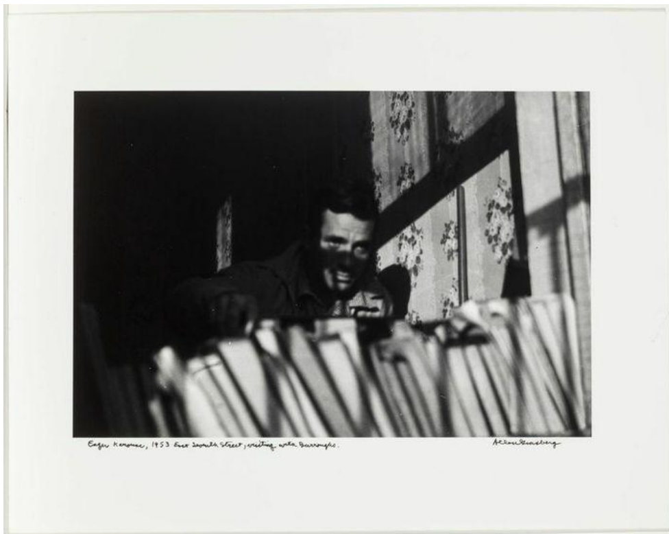
Jack Kerouac looking out the window apartment 206 E 7th street, 1953

The exhibit unfolds in three parts: the photographs, a looped audio piece of Ginsberg's voice reciting a number of poems, and a variety of objects—book editions, notes, images, drawings, etc.—that connect to Ginsberg and the Beat Generation. The photographs included are all black and white and contain meticulous descriptions added by Ginsberg in his own handwriting. The images share a lot in common besides the recurring figures photographed, namely, the manner in which they convey intimacy, eroticism, friendship, and, most importantly, the unforgiving passage of time. Faces begin to wrinkle and fade with age; we become more aware of the subjects' proximity to death (and therefore, mortality). While testimonial, the particular homage that Ginsberg provides does not carry a quality of glorification. Rather, it is delicate, melancholic, and somber—a glimpse into the poet and his friends' intimate lives.