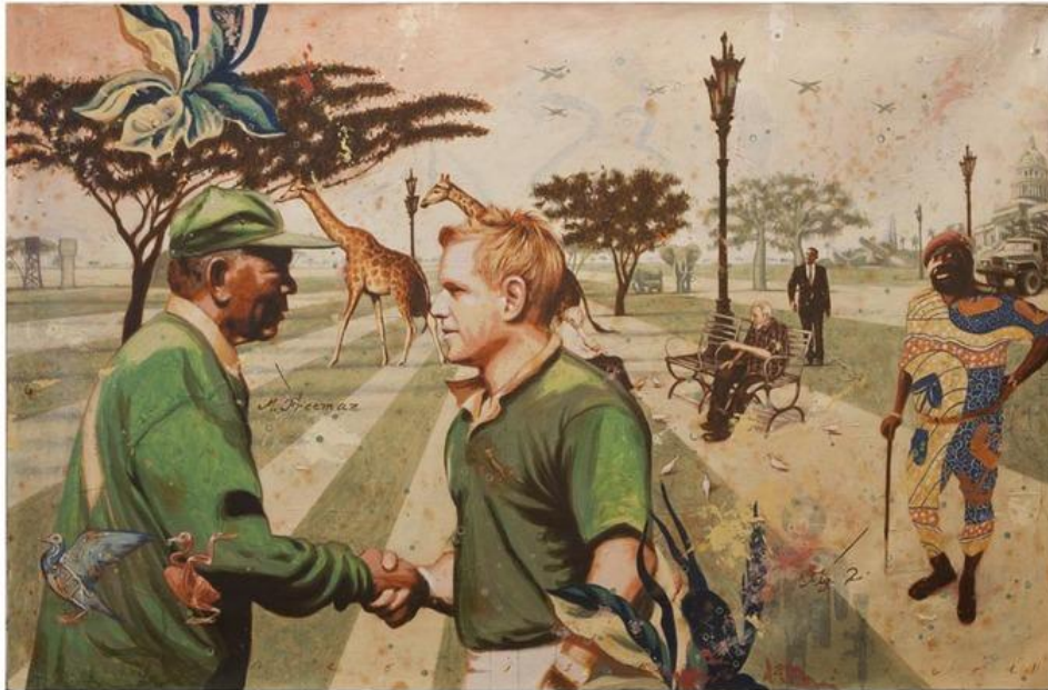
Alexis Esquivel Bermúdez, La Paix de Cuito Cuanavale o (un paseo por el parque Lenin después de la victoria) , 2011, 114 x 175 cm

Pervasive racism and the misunderstanding or hostility towards non-Western religious practices are global issues, says the curator. By addressing them, the exhibition transcends the boundaries of the Cuban experience, as these problems thrive in other locations such as the United States and most of Latin America. This exhibition has the potential to highlight how non-Cuban artists in other places are dealing with similar issues unique to their region, calling forward art's capacity for social activism.