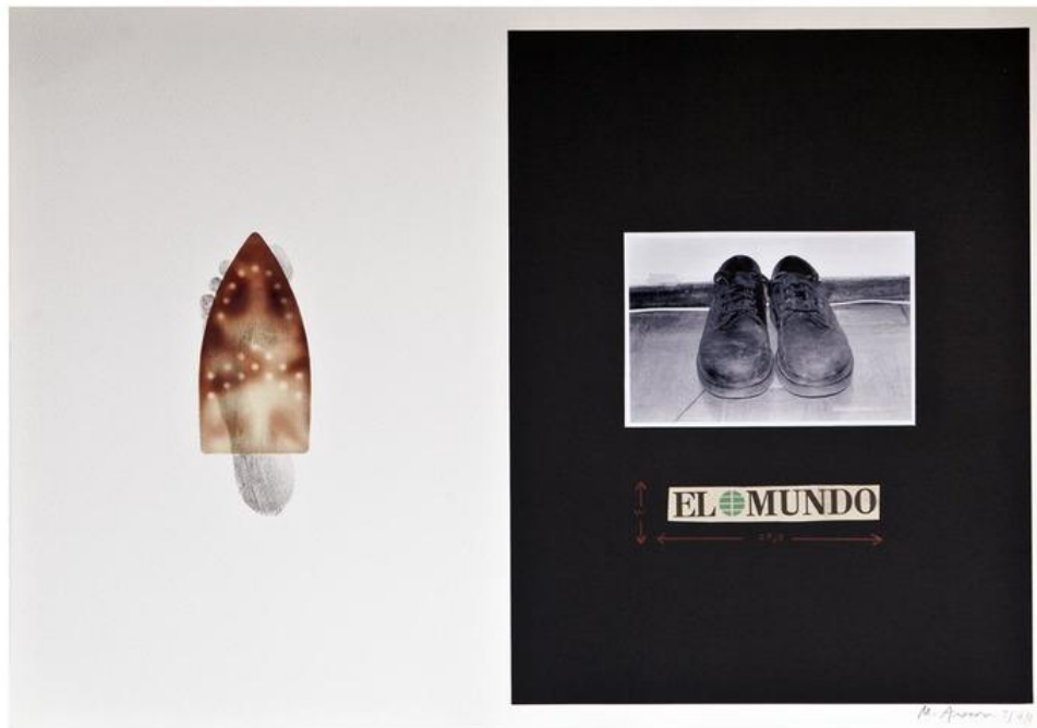
Manuel Arenas, El mundo , 2003, Collage, ash, and acrylic on card, 80 x 100 cm

Essential to the 1959 Revolution was forging the color-blind sentiment that Martí called for. Cubans came together to fight for the same cause, one that would affect all, rather than some fragments of the island's population. For Cubans of color, however, it soon became evident that the temporary sense of unity failed; racism persisted after the revolution and to this day.